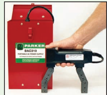
BAC310 - Portable, Stand alone Battery Inverted 115VAC Power Supply. Operate A.C. Yokes or other Instruments where normal power sources are unavailable.