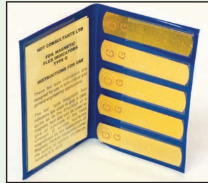
MG01/MG02 - Magnetic Field Strips Type 1 (G) and Type 2 (A)