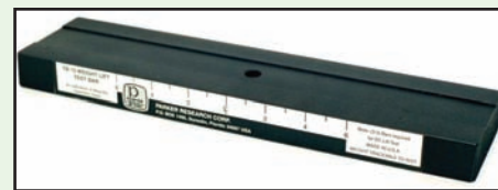
TB10 - Magnetic Weight Lift Test Bars. W/Certs Available in Single, 3, 4 or 5 Bar Sets. TB10-SP - 10-Lb Bar with artificial defects